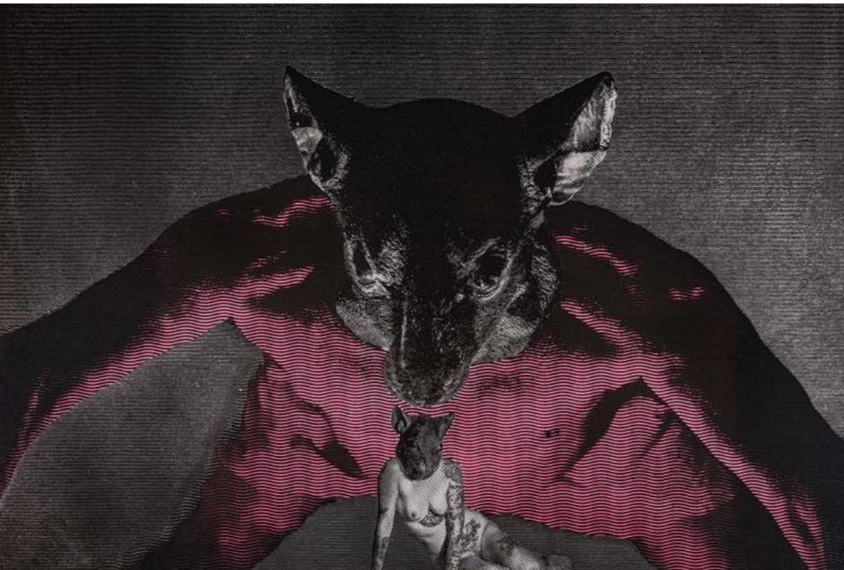
Reclining Rat, 40 x 60 inches, Laser engraved Woodcut, 2018

JANUARY 8 - MARCH 2, 2019 VERNISSAGE SATURDAY, JANUARY 12 AT 2PM